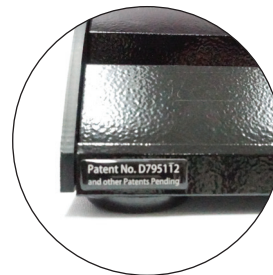
Patent No: D7951120